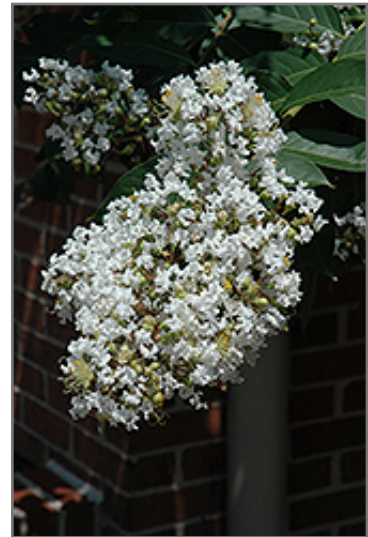
Natchez Crapemyrtle flowers

Natchez Crapemyrtle is a dense multi-stemmed deciduous tree with a shapely form and gracefully arching branches. Its average texture blends into the landscape, but can be balanced by one or two finer or coarser trees or shrubs for an effective composition.