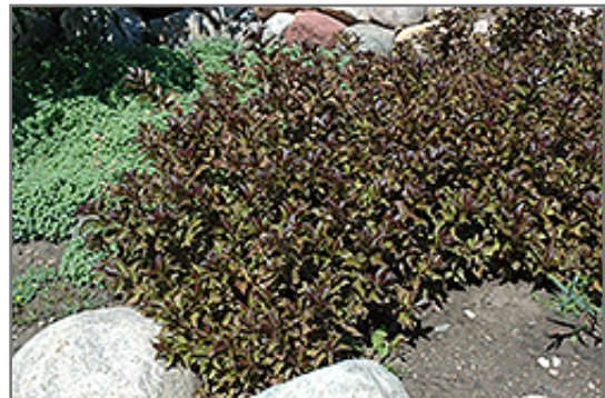
Dark Horse Weigela