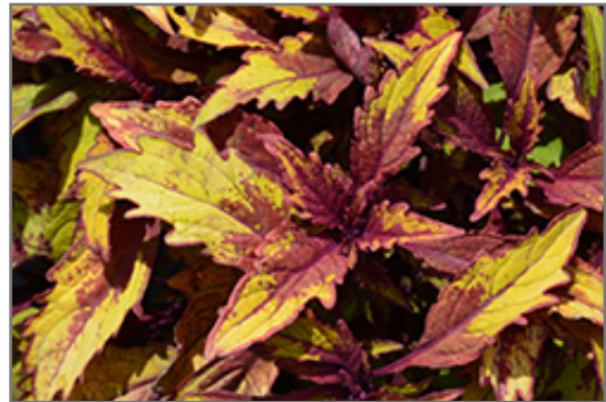
FlameThrower Spiced Curry Coleus foliage

FlameThrower Spiced Curry Coleus is recommended for the following landscape applications;