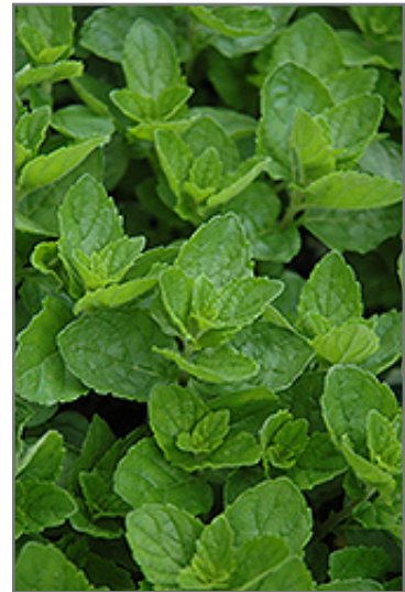
Spearmint foliage

Spearmint features bold spikes of lilac purple tubular flowers with white overtones rising above the foliage in late summer. Its attractive fragrant oval leaves remain green in color throughout the season.