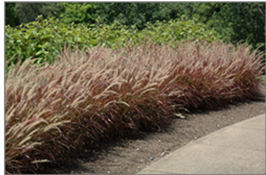
Purple Fountain Grass in bloom

Purple Fountain Grass will grow to be about 4 feet tall at maturity, with a spread of 3 feet. Although it's not a true annual, this plant can be expected to behave as an annual in our climate if left outdoors over the winter, usually needing replacement the following year. As such, gardeners should take into consideration that it will perform differently than it would in its native habitat.