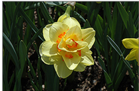
Tahiti Daffodil flowers