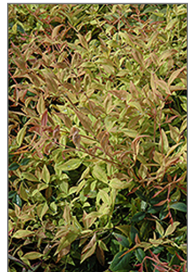
Gulf Stream Dwarf Nandina foliage