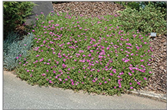
Purple Ice Plant in bloom