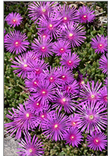
Purple Ice Plant flowers

Purple Ice Plant is an herbaceous evergreen perennial with a ground-hugging habit of growth. Its relatively fine texture sets it apart from other garden plants with less refined foliage.