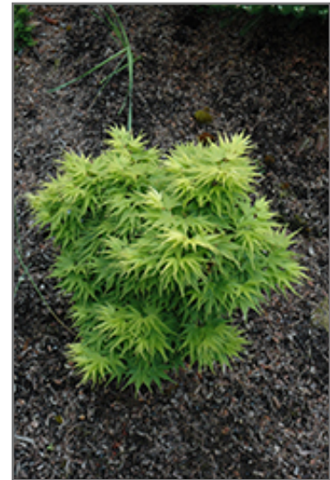
Mikawa Yatsubusa Japanese Maple

If planted in full sun, the new foliage can scorch during our hot summers. We recommend planting this Japanese Maple in a spot where it can receive morning sun with good afternoon shade. Dappled sunlight (as an understory plant) is also an excellent location.