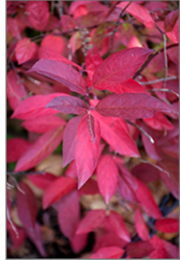
Henry's Garnet Virginia Sweetspire in fall

This shrub performs well in both full sun and full shade. It is an amazingly adaptable plant, tolerating both dry conditions and even some standing water. It is not particular as to soil type or pH. It is somewhat tolerant of urban pollution. This is a selection of a native North American species.