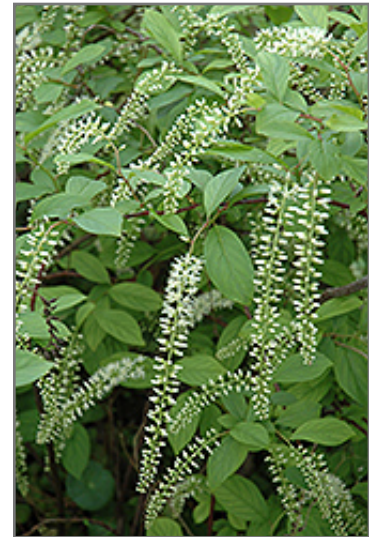
Henry's Garnet Virginia Sweetspire flowers