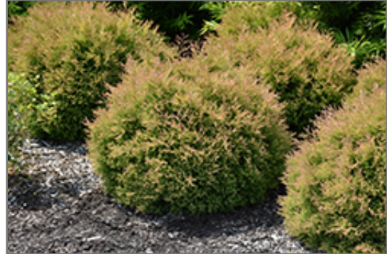
Fire Chief Arborvitae

Fire Chief Arborvitae will grow to be about 5 feet tall at maturity, with a spread of 5 feet. It tends to fill out right to the ground and therefore doesn't necessarily require facer plants in front, and is suitable for planting under power lines. It grows at a slow rate, and under ideal conditions can be expected to live for approximately 30 years.