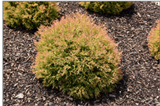
Fire Chief Arborvitae

This is a relatively low maintenance shrub. When pruning is necessary, it is recommended to only trim back the new growth of the current season, other than to remove any dieback. It has no significant negative characteristics.