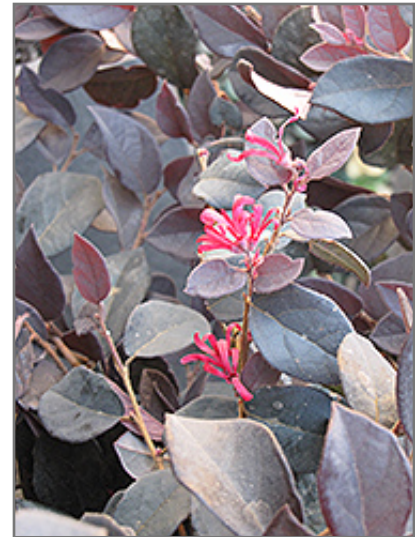
Purple Pixie Fringeflower flowers

This is a relatively low maintenance shrub, and should only be pruned after flowering to avoid removing any of the current season's flowers. It has no significant negative characteristics.