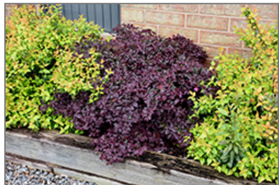
Purple Pixie Fringeflower