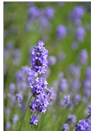
Hidcote Blue Lavender flowers