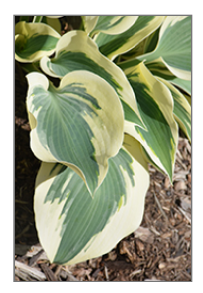
Blue Ivory Hosta foliage