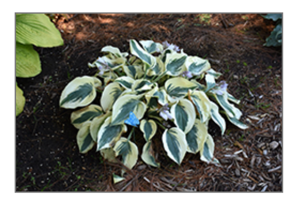
Blue Ivory Hosta