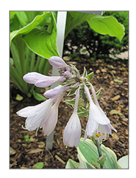
Blue Ivory Hosta flowers