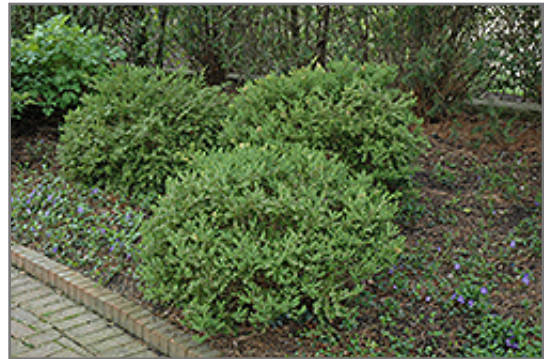
Wintergreen Boxwood

Wintergreen Boxwood is recommended for the following landscape applications;