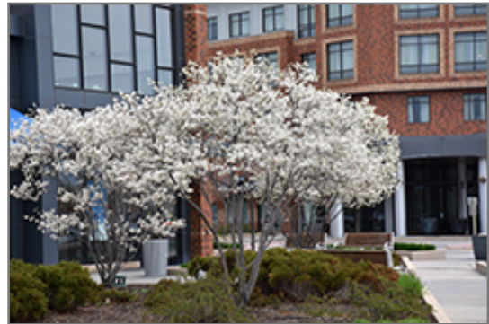
Autumn Brilliance Serviceberry in bloom

This is a relatively low maintenance tree, and is best pruned in late winter once the threat of extreme cold has passed. It is a good choice for attracting birds to your yard, but is not particularly attractive to deer who tend to leave it alone in favor of tastier treats. It has no significant negative characteristics.