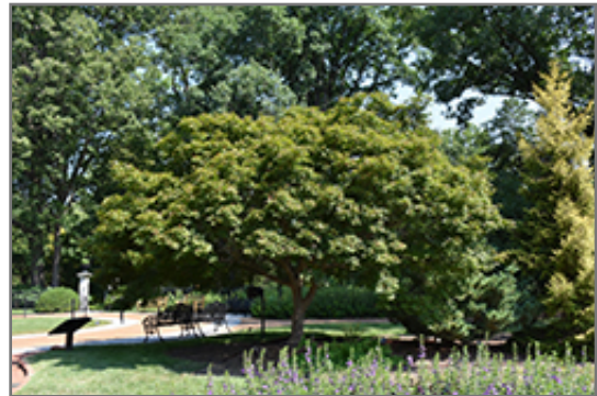
Trompenburg Japanese Maple

If planted in full sun, the new foliage can scorch during our hot summers. We recommend planting this Japanese Maple in a spot where it can receive morning sun with good afternoon shade. Dappled sunlight (as an understory plant) is also an excellent location.