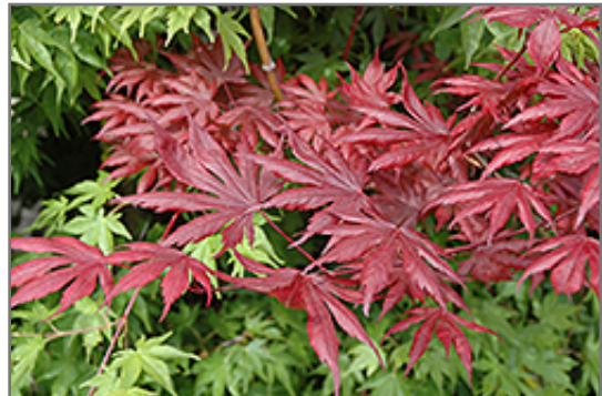
Trompenburg Japanese Maple foliage

Trompenburg Japanese Maple is a deciduous tree with an upright spreading habit of growth. It lends an extremely fine and delicate texture to the landscape composition which can make it a great accent feature on this basis alone.