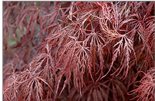
Crimson Queen Japanese Maple foliage

Crimson Queen Japanese Maple is recommended for the following landscape applications;