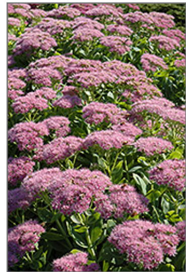
Brilliant Stonecrop flowers

Brilliant Stonecrop is recommended for the following landscape applications;