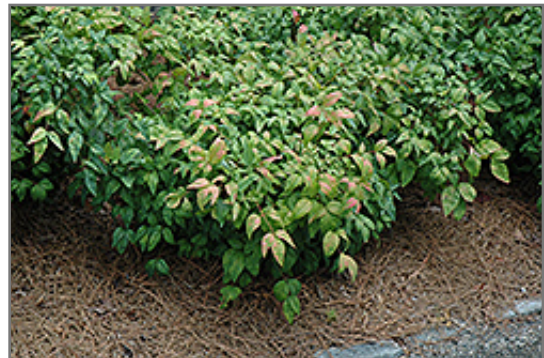
Fire Power Nandina