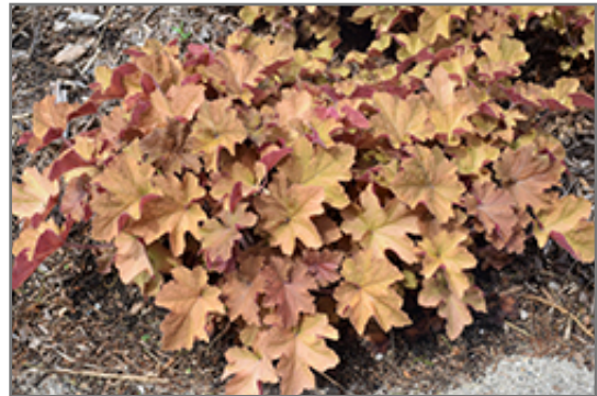
Caramel Coral Bells

Caramel Coral Bells will grow to be about 10 inches tall at maturity extending to 18 inches tall with the flowers, with a spread of 18 inches. When grown in masses or used as a bedding plant, individual plants should be spaced approximately 15 inches apart. Its foliage tends to remain low and dense right to the ground. It grows at a medium rate, and under ideal conditions can be expected to live for approximately 10 years. As an evergreen perennial, this plant will typically keep its form and foliage year-round.