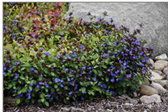
Plumbago in bloom