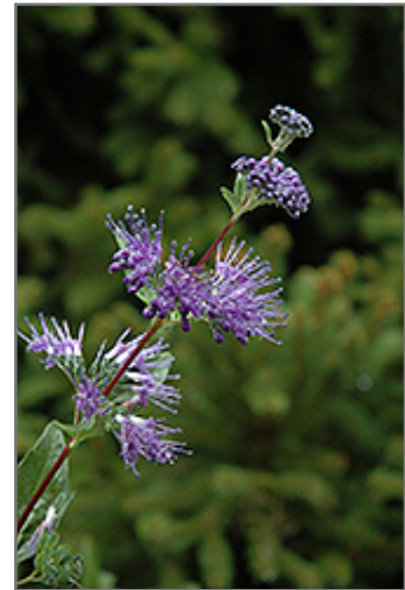
Blue Mist Caryopteris flowers

Blue Mist Caryopteris is recommended for the following landscape applications;