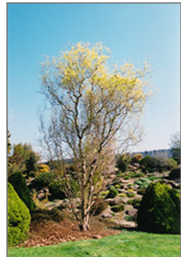
Dragon's Claw Willow in winter