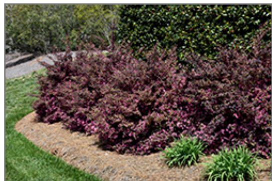
Red-Flowered Chinese Fringeflower in bloom