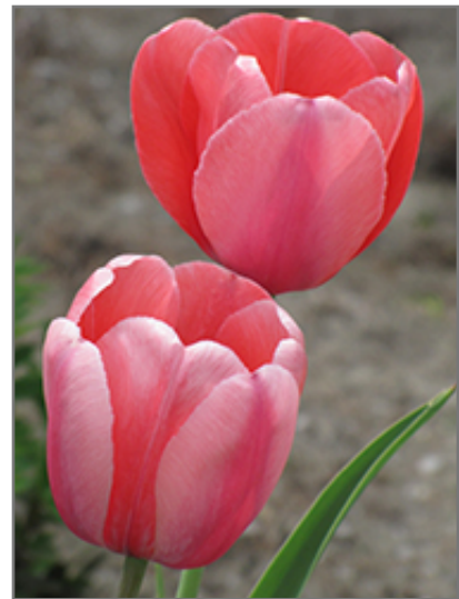
Pink Impression Tulip flowers