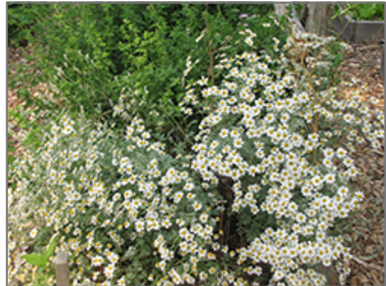
German Chamomile

German Chamomile will grow to be about 24 inches tall at maturity, with a spread of 18 inches. It grows at a fast rate, and under ideal conditions can be expected to live for approximately 5 years. As an herbaceous perennial, this plant will usually die back to the crown each winter, and will regrow from the base each spring. Be careful not to disturb the crown in late winter when it may not be readily seen!