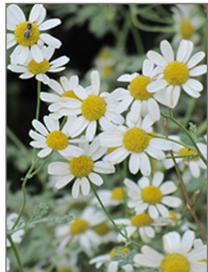
German Chamomile flowers