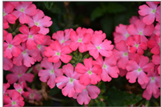
Firehouse Pink Verbena flowers

This plant will require occasional maintenance and upkeep. Trim off the flower heads after they fade and die to encourage more blooms late into the season. Deer don't particularly care for this plant and will usually leave it alone in favor of tastier treats. It has no significant negative characteristics.