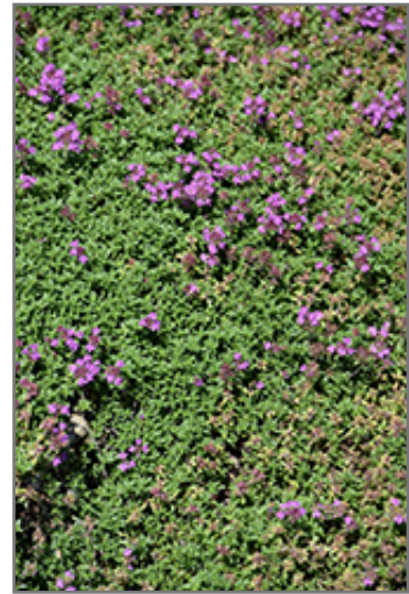
Creeping Thyme in bloom

This is a relatively low maintenance plant, and is best cleaned up in early spring before it resumes active growth for the season. Deer don't particularly care for this plant and will usually leave it alone in favor of tastier treats. It has no significant negative characteristics.