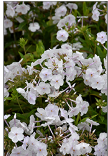
Fashionably Early Crystal Garden Phlox flowers

This plant will require occasional maintenance and upkeep, and should be cut back in late fall in preparation for winter. It is a good choice for attracting butterflies and hummingbirds to your yard. Gardeners should be aware of the following characteristic(s) that may warrant special consideration;