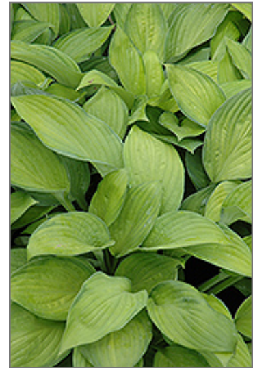
Gold Standard Hosta foliage