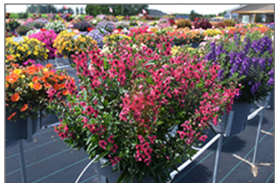
Archangel Cherry Red Angelonia in bloom