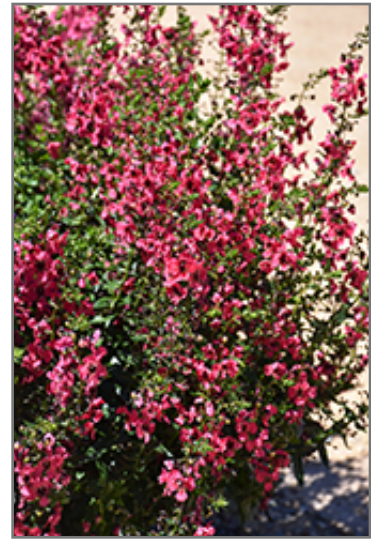
Archangel Cherry Red Angelonia flowers

Archangel Cherry Red Angelonia is an herbaceous annual with an upright spreading habit of growth. Its relatively fine texture sets it apart from other garden plants with less refined foliage.