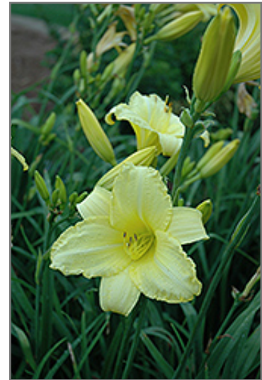
Happy Ever Appster Happy Returns Daylily flowers

This is a relatively low maintenance plant, and is best cleaned up in early spring before it resumes active growth for the season. It is a good choice for attracting butterflies to your yard. It has no significant negative characteristics.