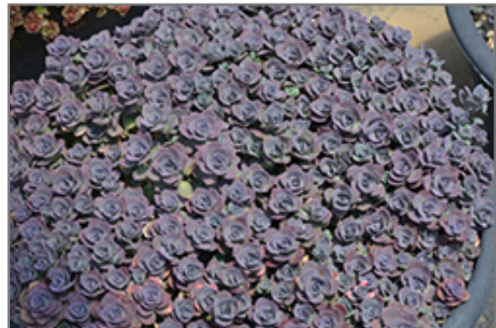
SunSparkler Blue Elf Sedoro