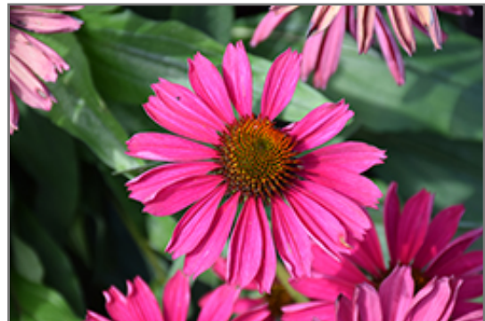
Kismet Raspberry Coneflower flowers