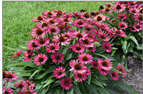
Kismet Raspberry Coneflower in bloom