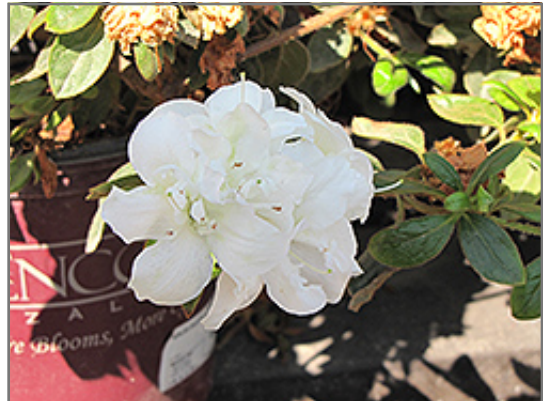
Encore Autumn Moonlight Azalea flowers