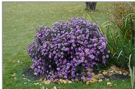
Purple Dome Aster in bloom