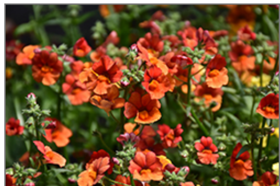
Sunsatia Blood Orange Nemesia flowers