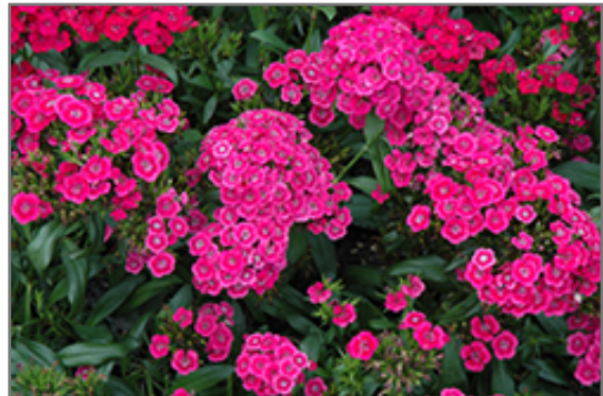
Jolt Pink Hybrid Pinks flowers

Jolt Pink Hybrid Pinks is an herbaceous evergreen perennial with a mounded form. It brings an extremely fine and delicate texture to the garden composition and should be used to full effect.