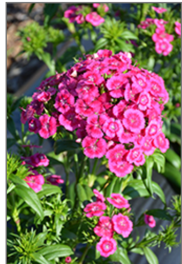
Jolt Pink Hybrid Pinks flowers