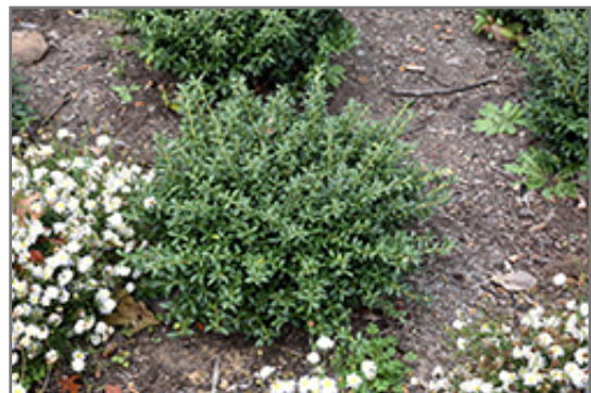
Soft Touch Japanese Holly