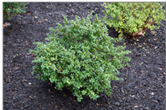
Green Lustre Japanese Holly