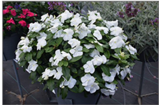
Titan Pure White Vinca in bloom

Titan Pure White Vinca will grow to be about 14 inches tall at maturity, with a spread of 12 inches. Its foliage tends to remain dense right to the ground, not requiring facer plants in front. Although it's not a true annual, this fast-growing plant can be expected to behave as an annual in our climate if left outdoors over the winter, usually needing replacement the following year. As such, gardeners should take into consideration that it will perform differently than it would in its native habitat.