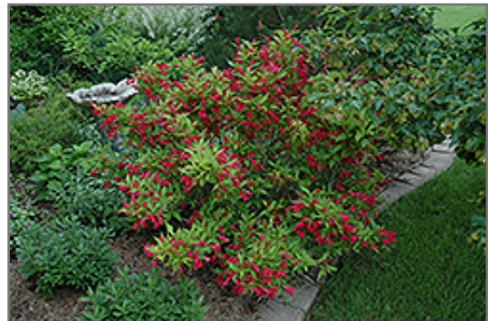
Red Prince Weigela in bloom