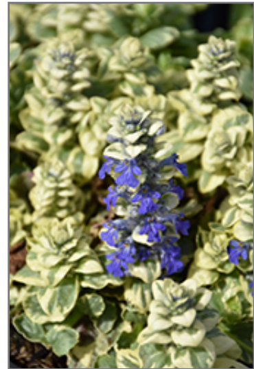
Silver Queen Bugleweed flowers

Silver Queen Bugleweed is a dense herbaceous evergreen perennial with a ground-hugging habit of growth. Its medium texture blends into the garden, but can always be balanced by a couple of finer or coarser plants for an effective composition.