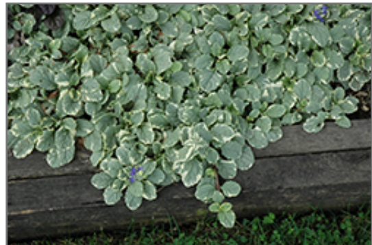
Silver Queen Bugleweed