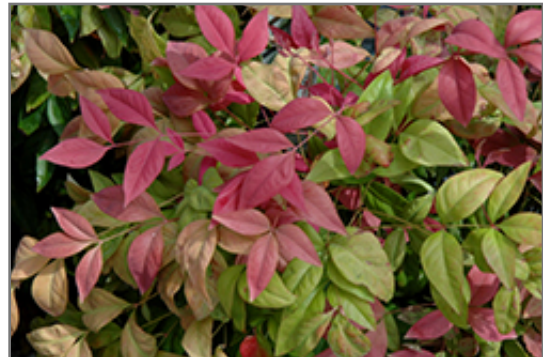
Blush Pink Nandina foliage

Blush Pink Nandina is recommended for the following landscape applications;