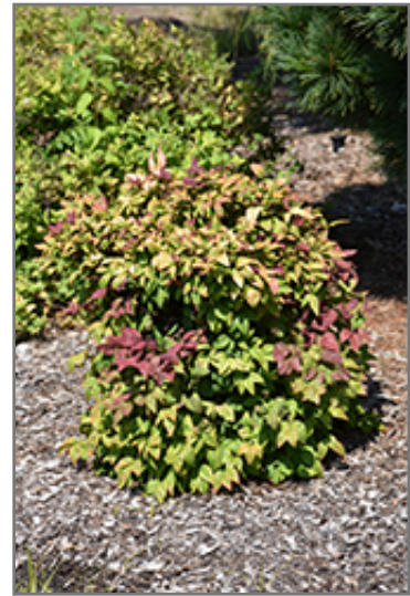
Blush Pink Nandina

Blush Pink Nandina makes a fine choice for the outdoor landscape, but it is also well-suited for use in outdoor pots and containers. It can be used either as 'filler' or as a 'thriller' in the 'spiller-thriller-filler' container combination, depending on the height and form of the other plants used in the container planting. It is even sizeable enough that it can be grown alone in a suitable container. Note that when grown in a container, it may not perform exactly as indicated on the tag - this is to be expected. Also note that when growing plants in outdoor containers and baskets, they may require more frequent waterings than they would in the yard or garden.