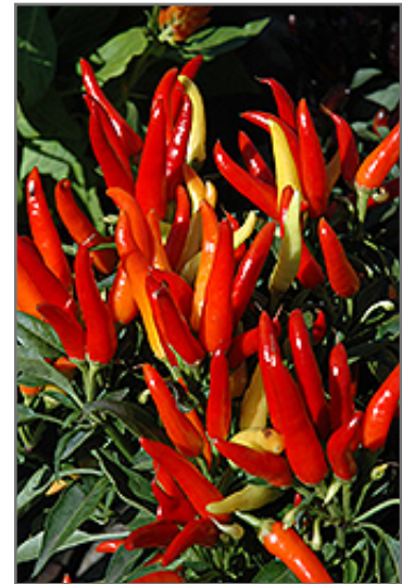
Chilly Chili Ornamental Pepper fruit