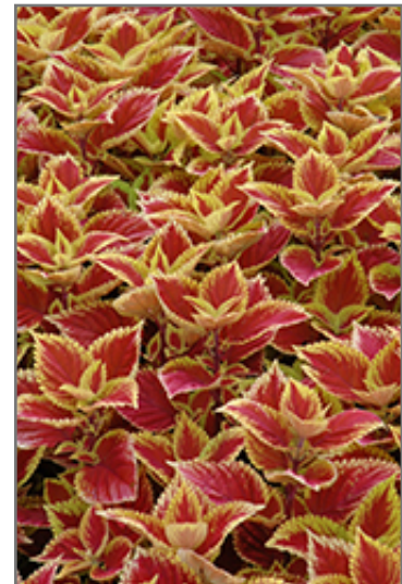
Trusty Rusty Coleus foliage