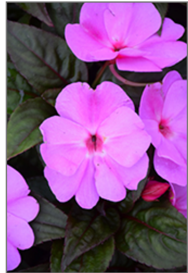
Divine Lavender New Guinea Impatiens flowers

This plant will require occasional maintenance and upkeep, and should not require much pruning, except when necessary, such as to remove dieback. It has no significant negative characteristics.