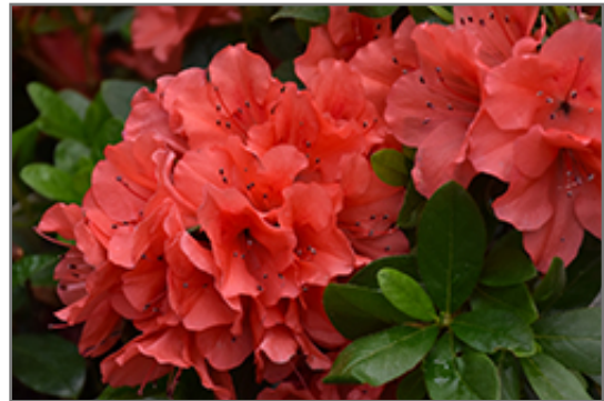
Encore Autumn Sunset Azalea flowers