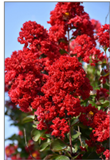
Dynamite Crapemyrtle flowers